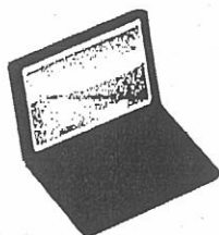
For every hour spent reading the STERN REVIEW ON COMPUTER