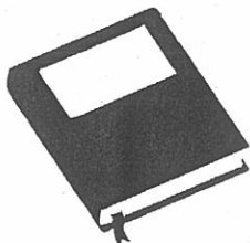
Each copy of the STERN REVIEW PRINTED

When making a comparison between reading the printed version of the Stern Review and viewing its content using electronic media, the environmental impacts are quite surprising.