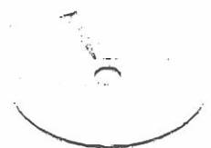
Just to manufacture the STERN REVIEW ON DVD