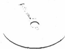
Just to manufacture the STERN REVIEW ON CD